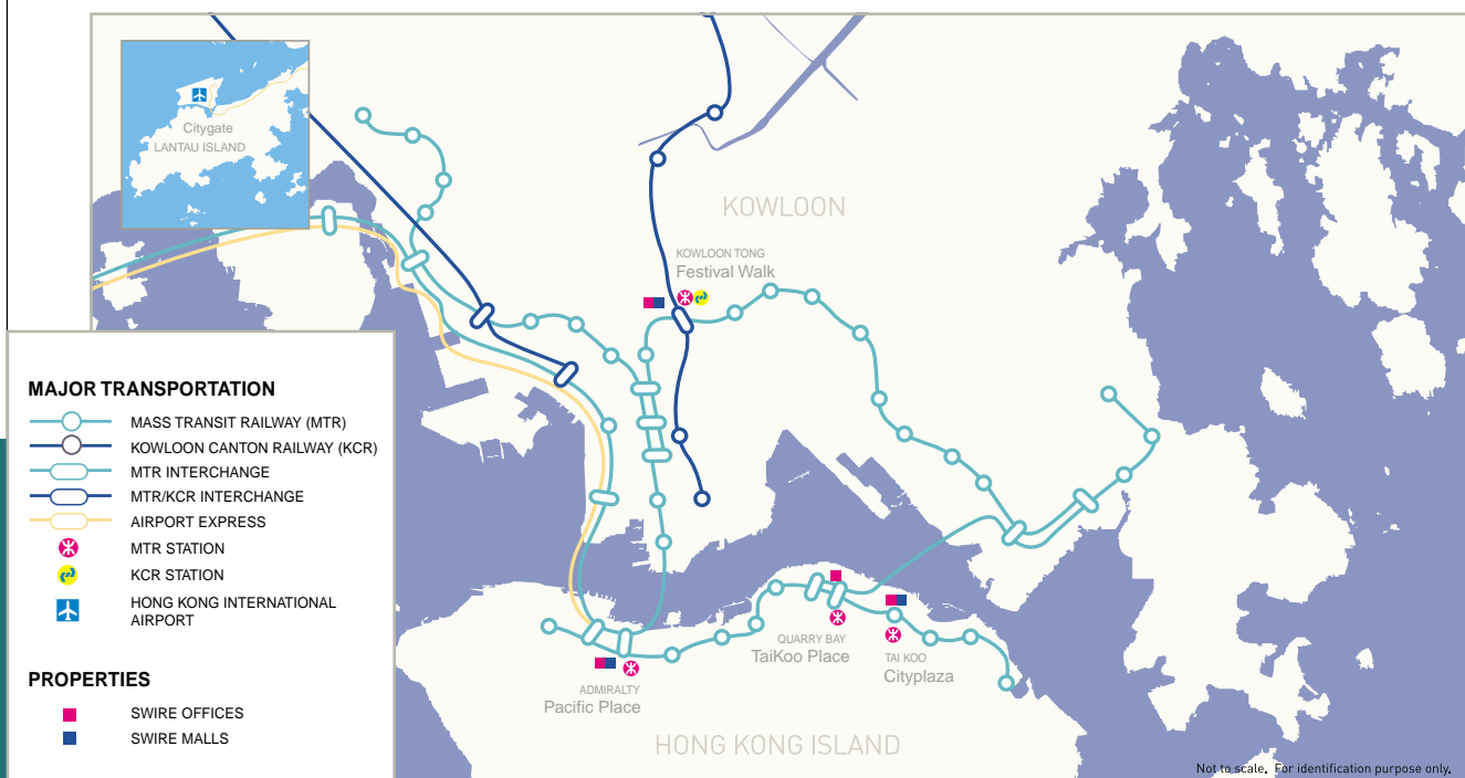
This map shows the geographic locations of our major investment properties and the major mass transit railway lines in Hong Kong.

Swire Properties' philosophy is based on contributing positively to society and the concept of 'building communities' not just buildings. Our strategy is to carefully plan our core developments at principal mass transit railway intersections. Our shopping centres, office towers and residential estates add to existing transport hubs, helping to create genuine communities. In this way, we are able to reduce congestion and associated pollution, maximise convenience and contribute to the effective and efficient functioning of Hong Kong.