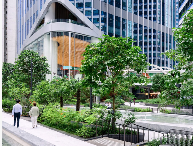
Taikoo Square and Taikoo Garden