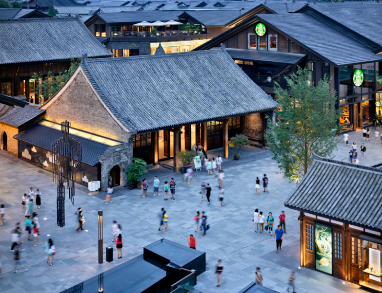
Taikoo Li Chengdu