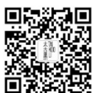
WeChat Service @BJTaikooliSanlitun

Official Platforms www.taikoolisanlitun.com ; www.theoppositehouse.com