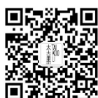
WeChat Service @BJTaikooliSanlitun

Official Platforms www.taikoolisanlitun.com